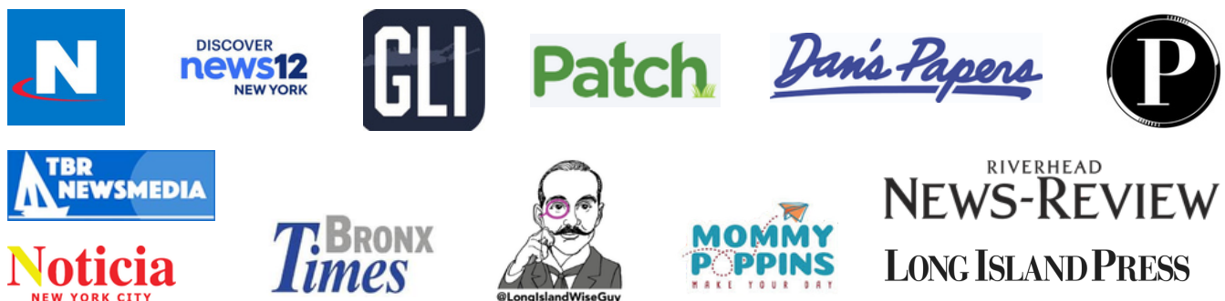
Examples from Nikola Tesla Expo 2025